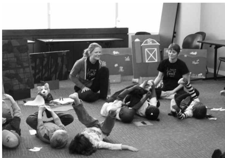
At a recent Earth Day event, FACT presented our humane education workshop, "The Awesome Adventures of Sweet Pea the Pig."

Non-Profit Org. U.S. POSTAGE PAID Chicago, Illinois Permit No. 2652